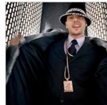
The Celebrity Bowl XLI