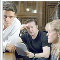
Pretending to Like the Little People