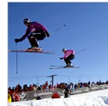
Ski Tour Brings Many Parties