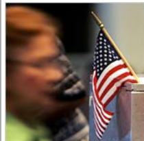
Warner: The Irrational Voter